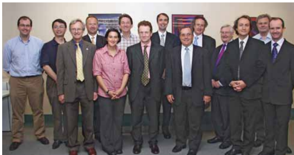
The inaugural ITUAG meeting with the AMMRF Board at the University of Sydney on 4 December 2008.