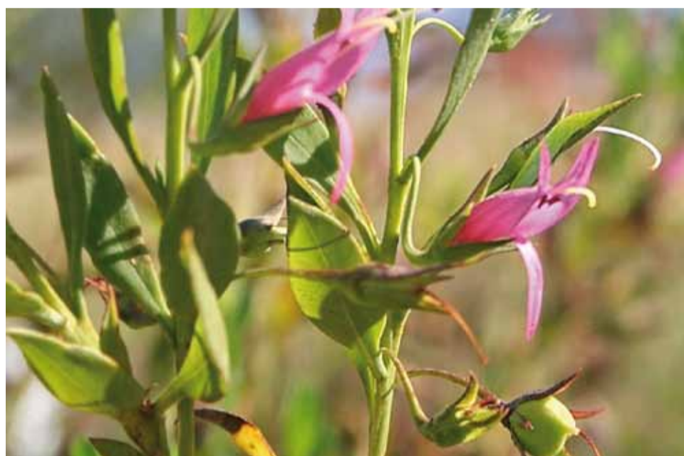
Eremophila denticulata subsp. trisulcata (Chinnoek), a taxon identified as having resin with antibacterial activity. The glossy and waxy appearance of the leaves is typical of resinous Eremophila species.