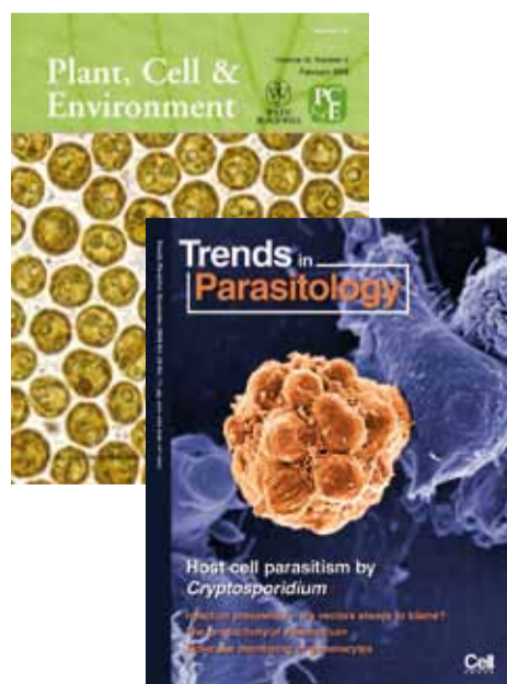
Covers copyright Elsevier and Blackwell Publishing.