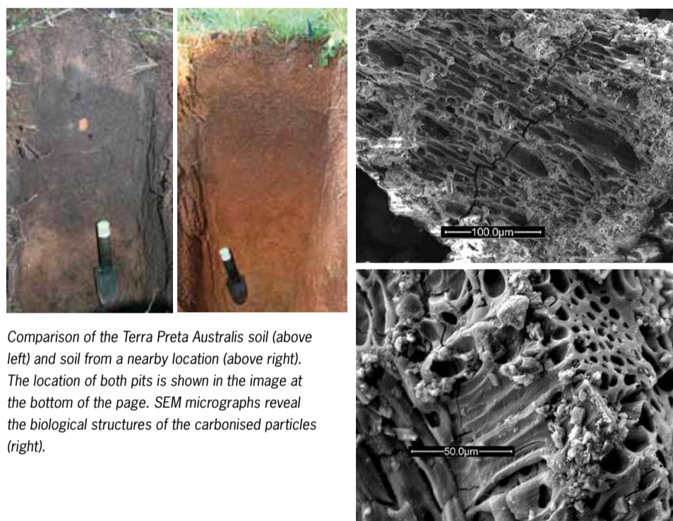
Comparison of the Terra Preta Australis soil (above left) and soil from a nearby location (above right). The location of both pits is shown in the image at the bottom of the page. SEM micrographs reveal the biological structures of the carbonised particles (right).

Prof. Munroe has a long-standing interest in biochar and the ARC Linkage Project has enabled him to characterise biochars generated by a variety of production methods. Analysis of the Terra Preta soils has shown that the carbonised biomass remains in the soil for many hundreds of years and maintains its carbon content over time. So, as well as sequestering significant amounts of carbon from the environment, the addition of biochars has the potential to greatly improve soil productivity and therefore improve food security for future generations. ■